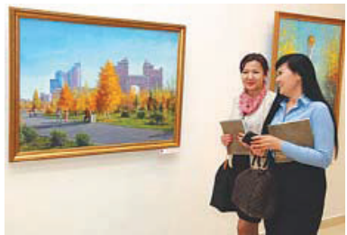
Kyrgyz artists have displayed their vision of Astana at the Palace of Peace and Harmony.