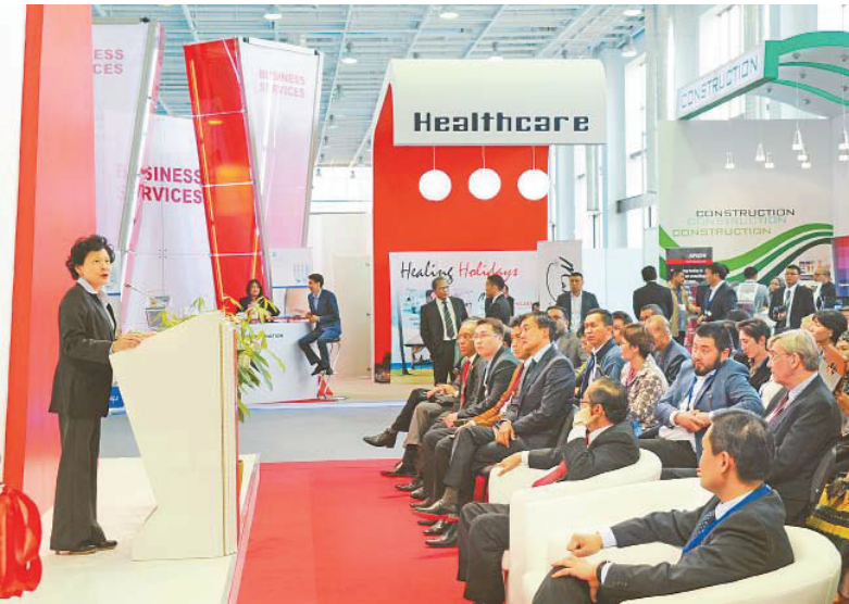
Malaysian officials presented new products and services at the Korme exhibition complex in Astana.